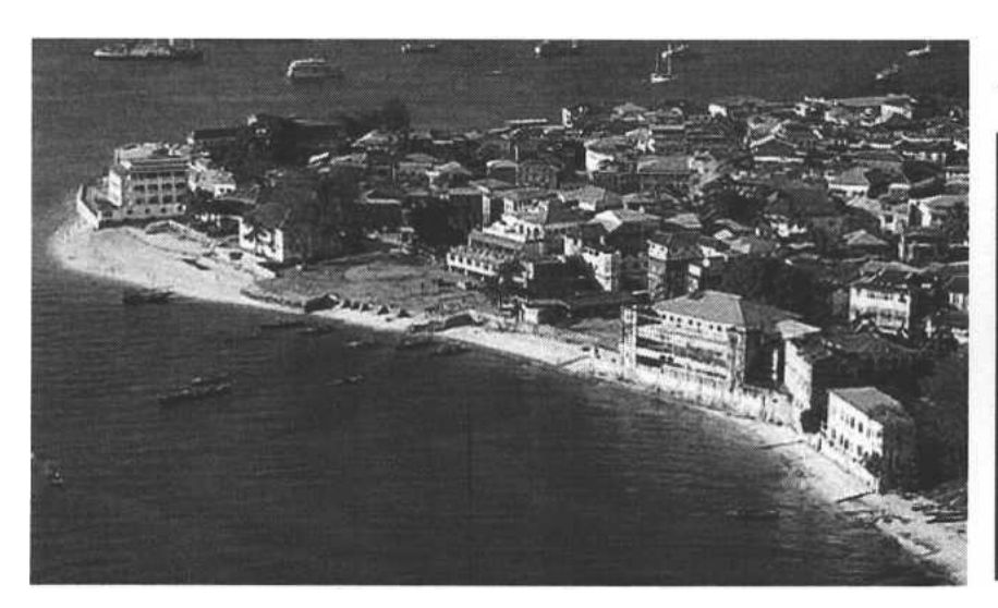
< Zanzibar's capital, Stone Town

Departure from the hotel after breakfast. We're off on a "spice tour" of this "spice island," one of the few places in the world where saffron and many other Middle Eastern/Asian spices such as cardamom, ginger, cloves, nutmeg, etc. are grown, including visits to some the beautiful plantations. Also visit to the Jozani Forest , featuring some very exotic (and large) trees and ferns and other tropical types of vegetation and inhabited by a native species of monkeys, the Red Colobus, now nearly extinct. Return to hotel.